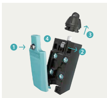
Simple plug-in mounting

The modular design of the standard position switches saves time and increases flexibility during installation of a whole range of switch versions.