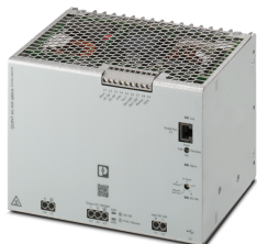
Inverter, QUINT INVERTER, DIN rail mounting, input:24 V DC, output:1AC / 600 VA, Pure sine.

Please be informed that the data shown in this PDF Document is generated from our Online Catalog. Please find the complete data in the user's documentation. Our General Terms of Use for Downloads are valid ( http://phoenixcontact.com/download )